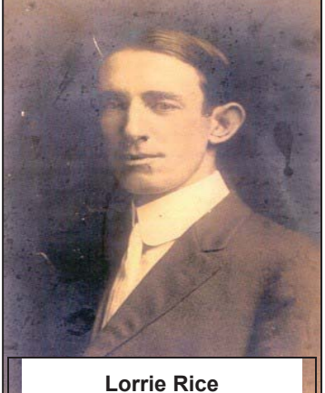
Alabama's first State Fire Marshal

From 1935 to 1951, the Superintendent of Insurance was Ex-Officio State Fire Marshal. During this time, the direction of the State Fire Marshal's office fell primarily on a Chief Deputy State Fire Marshal, as follows: